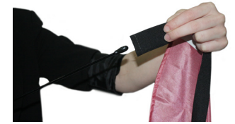
Feed the antennne through pocket that runs along side the graphic. 4