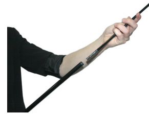
Place antennne into top of pole. 3