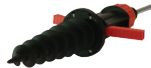
Push thumb into thumbholes on red handles to extend.