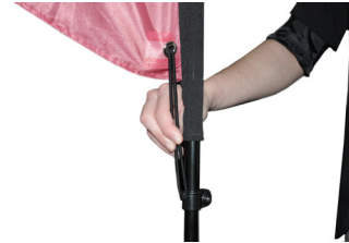
Attach bungee cord to the hook on pole to hold graphic in place. 7