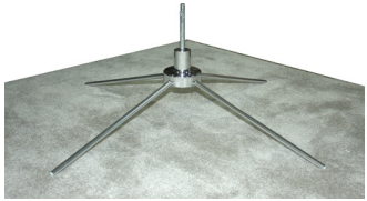
Unfold the stand. 1