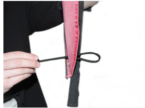
Secure graphic to pole by threading the bungee through the grommet. 6