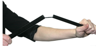
Assemble bungee pole. 2