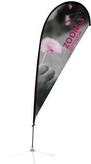
unit is complete 8