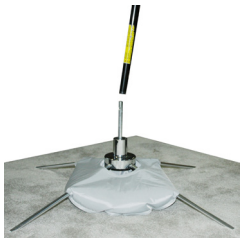
Once graphic is applied, place pole on stand. 5