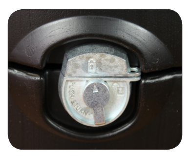
Push & turn locking mechanism